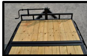
4' Stationary (Option)