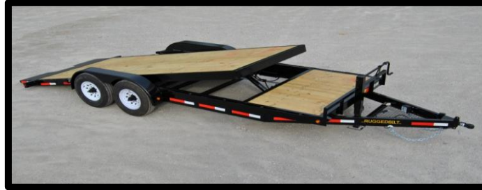
Model: GTH8216 Shown with a 4' Stationary Option