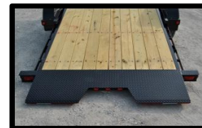
Low Load Angle Approach